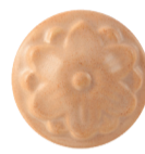
Sonoma** HSC 2-557 - 118 ml HSC 3-557 - 473 ml