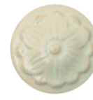
Sandy Beach** HSC 2-572 - 118 ml HSC 3-572 - 473 ml