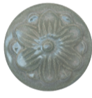
Stonehenge** HSC 2-578 - 118 ml HSC 3-578 - 473 ml