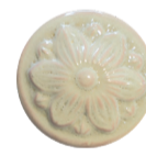
NEW! Creamy Flux HSC 2-579 - 118 ml HSC 3-579 - 473 ml