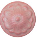
Coral Reef** HSC 2-573 - 118 ml HSC 3-573 - 473 ml