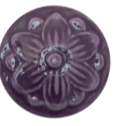
Napa Valley* HSC 2-568 - 118 ml HSC 3-568 - 473 ml