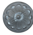
Graphite** HSC 2-571 - 118 ml HSC 3-571 - 473 ml