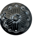
Onyx* HSC 2-563 - 118 ml HSC 3-563 - 473 ml