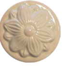
NEW! Ghost Flux HSC 2-580 - 118 ml HSC 3-580 - 473 ml