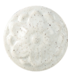
Mystique White* HSC 2-553 - 118 ml HSC 3-553 - 473 ml