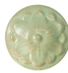
Sagebrush** HSC 2-556 - 118 ml HSC 3-556 - 473 ml