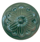
Emerald HSC 2-576 - 118 ml HSC 3-576 - 473 ml