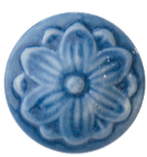
Egyptian Blue* HSC 2-551 - 118 ml HSC 3-551 - 473 ml