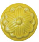
Mustard Seed* HSC 2-564 - 118 ml HSC 3-564 - 473 ml