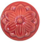
Watermelon* HSC 2-574 - 118 ml HSC 3-574 - 473 ml