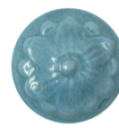
Blue Danube* HSC 2-558 - 118 ml HSC 3-558 - 473 ml