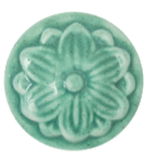
Jadeite* HSC 2-552 - 118 ml HSC 3-552 - 473 ml