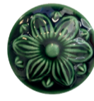
NEW! Evergreen* HSC 2-581 - 118 ml HSC 3-581 - 473 ml

Layer these glazes for unique colors and effects: *High Gloss Colors | **Matte/Satin Colors