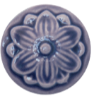
Lavender* HSC 2-569 - 118 ml HSC 3-569 - 473 ml