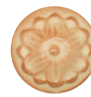
Siena** HSC 2-559 - 118 ml HSC 3-559 - 473 ml