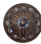
Cedar Wood* HSC 2-566 - 118 ml HSC 3-566 - 473 ml