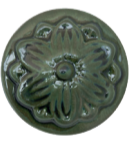
Seaweed HSC 2-575 - 118 ml HSC 3-575 - 473 ml