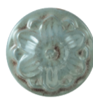
San Fran Fog** HSC 2-555 - 118 ml HSC 3-555 - 473 ml