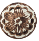
Rustic Brown HSC 2-550 - 118 ml HSC 3-550 - 473 ml

NEW!!! Transparent "Ghost" FLUX and "CREAMY" FLUX are moving glazes and with generous amount over the other Terra Bella colors, they will create beautiful high fire flow results.