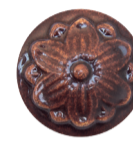
Chestnut* HSC 2-562 - 118 ml HSC 3-562 - 473 ml