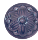
Blueberry* HSC 2-567 - 118 ml HSC 3-567 - 473 ml