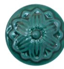
Spruce HSC 2-577 - 118 ml HSC 3-577 - 473 ml