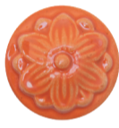
Papaya* HSC 2-570 - 118 ml HSC 3-570 - 473 ml