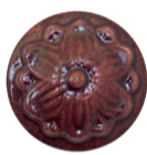
Cinnamo* HSC 2-565 - 118 ml HSC 3-565 - 473 ml