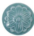
Ocean Mist* HSC 2-554 - 118 ml HSC 3-554 - 473 ml